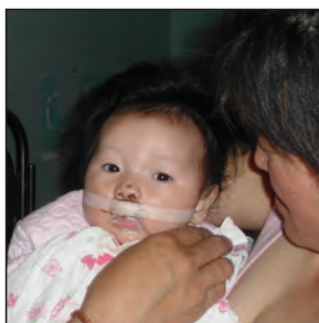
Mom & Baby