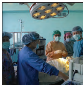
The Surgical Team