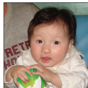
A Brand New Smile!